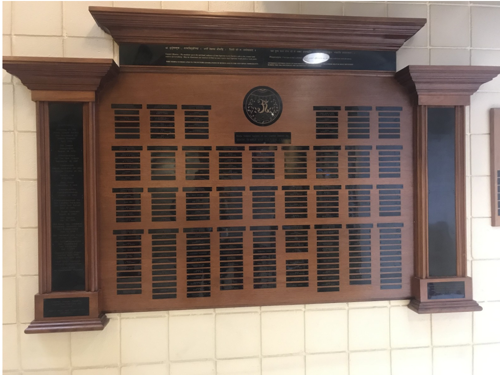
Exhibit 2: Temple Incorporators