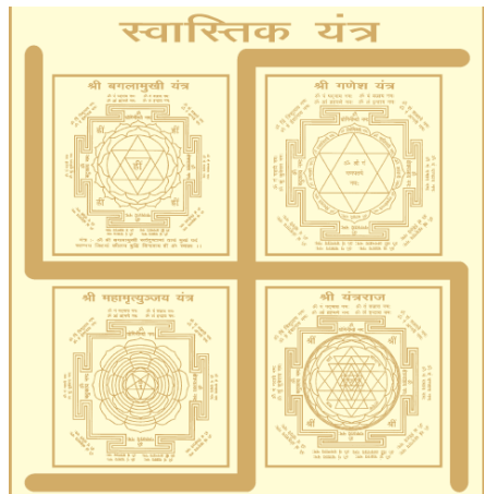
Hindu Altars and Instruments

Buddhist, Jain, Zoroastrian, and many other traditions, worldwide